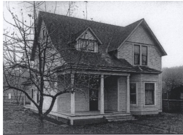
June Drake Home