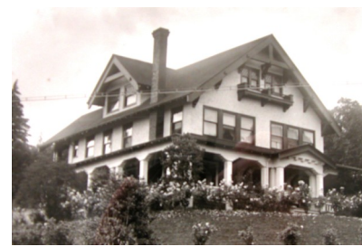
L.J. Adams Home