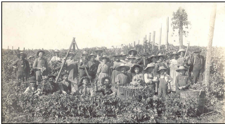
Early Days in the Hop Fields